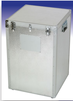
Shipping Case Biotrek 3. Part Number 9701178.