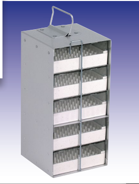
Cryobox rack system (5x 100 cell cryoboxes). Part Number 5801272.