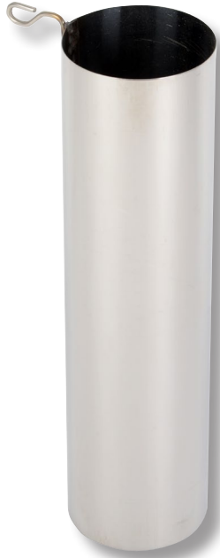
Biotrek 10 cannister system (x4)

Internally both Biotreks contain a special cryo-absorbant material which locks in liquid nitrogen to ensure that although any samples held are not immersed in liquid nitrogen they are close as possible to liquid nitrogen storage temperatures.