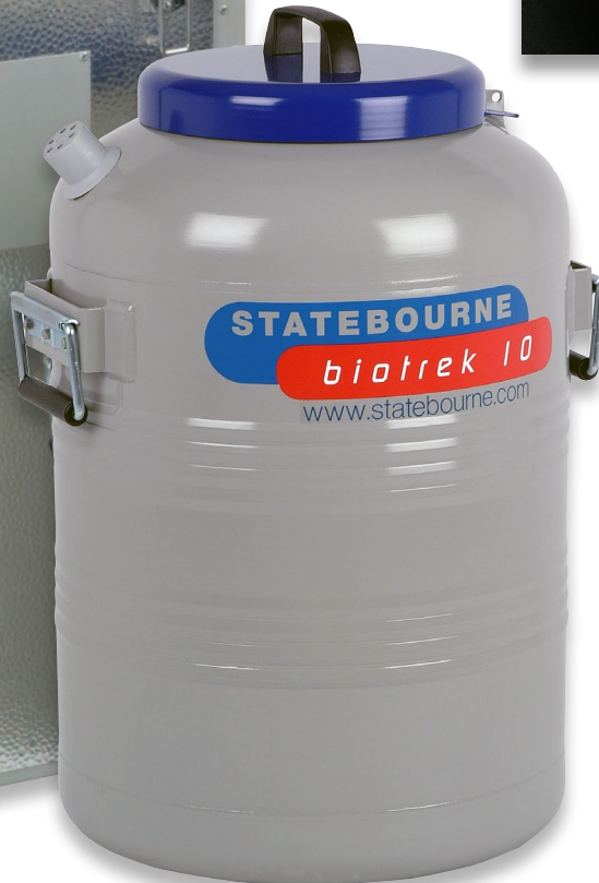
Biotrek 10 cannister system (x4) Part Number 5801160