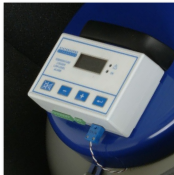
A temperature Logger Alarm can be fitted to travel with the Biotrek units to provide a continuous record of transit temperature.