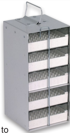
The Biotrek 10 will hold up to 5 x 100 cell cryoboxes in a specially designed rack.

A wide range of Biological specimens may be held in the Biotrek 3 while the Biotrek 10 can also accommodate blood stem cell bags because of the extra wide neck and internal configuration.