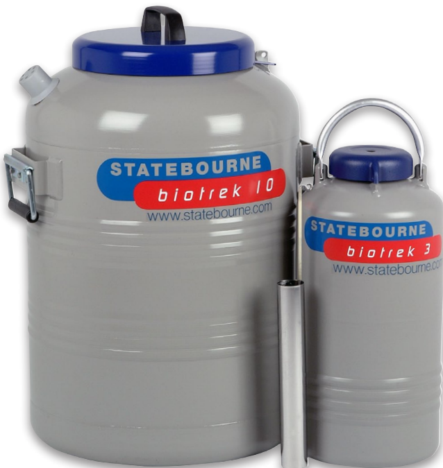
Storage system not included with the Biotrek 10.

A wide range of Biological specimens may be held in the Biotrek 3 while the Biotrek 10 can also accommodate blood stem cell bags because of the extra wide neck and internal configuration.